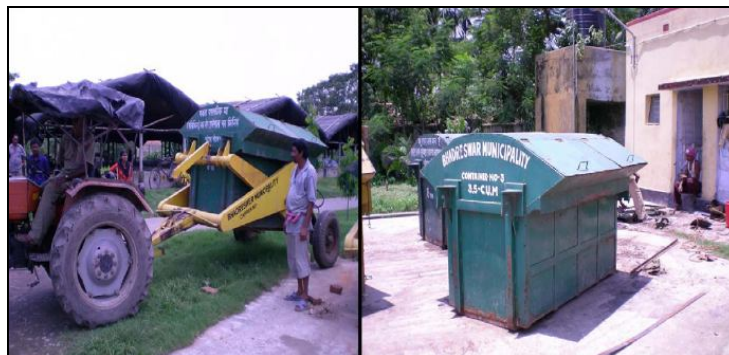
Figure 3: Example of a hauled container system used in Bhadreswar municipality, West Bengal. [6]

condition, inadequate labor for collection and transport of waste, and lack of waste treatment and disposal facilities. 12 samples are collected and tested and various parameters such as moisture content, total solids, fixed solids, organic carbon, volatile solids and calorific value are analyzed and revealed that Kharagpur has high moisture content and low calorific value, making aerobic composting the best treatment strategy. Composting can help to divert more than 80% of the total waste and will lead to enormous savings in costs of waste collection, transport and disposal. The remaining waste can be disposed off in an engineered landfill. Augmentation in labor and vehicle inventory has been proposed along with better treatment and disposal facilities.