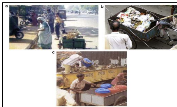
Figure 2: Road Sweeping (a), regular handcarts (b) and containerized handcarts (c). [5]

Hazra and goel 2009 gives an overview of current solid waste management (SWM) practices in Kolkata, India and suggests solutions to some of the major problems. More than around 2920ton/day of solid waste are generated in Kolkata Municipal Corporation, 60–70% are collected with the deficient in terms of manpower and vehicle availability. And conclude Lack of suitable facilities (equipment and infrastructure) and underestimates of waste generation rates, inadequate management and technical skills, improper bin collection, and route planning are responsible for poor collection and transportation of municipal solid wastes.